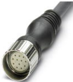
M23 socket, straight, 12-pos., with 5 m master cable, pin 9 and 10 bridged

Please be informed that the data shown in this PDF Document is generated from our Online Catalog. Please find the complete data in the user's documentation. Our General Terms of Use for Downloads are valid ( http://phoenixcontact.com/download )