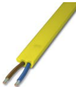
AS-Interface PVC flat conductor with UL in yellow, 2 x 1.5 mm 2 , 1000 m on an one-way drum

Please be informed that the data shown in this PDF Document is generated from our Online Catalog. Please find the complete data in the user's documentation. Our General Terms of Use for Downloads are valid ( http://phoenixcontact.com/download )